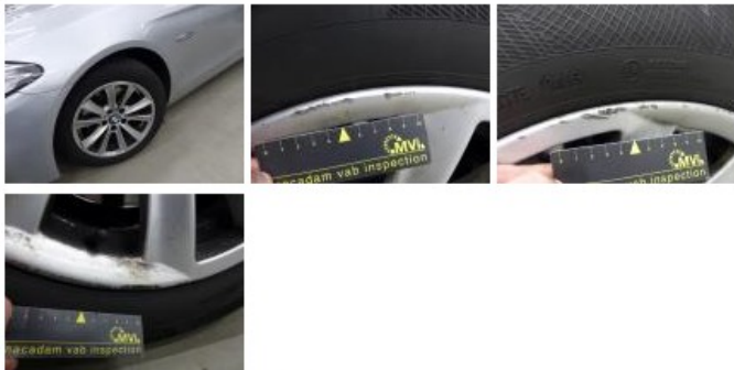
Wing F L, Bad repair, Acceptable 0,00