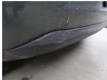
Wing R L, Bump(s) and scratch(es), LI - Repair and paint (complete) 246,56