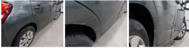
Door R L, Bump(s) and scratch(es), LI - Repair and paint (complete) 254,68