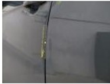
Bumper moulding R, Bump(s), E - Replace 50,00