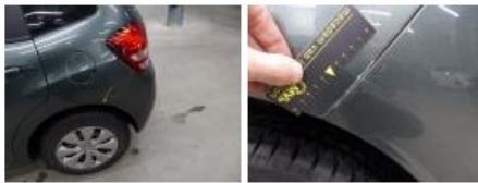
Bumper R, Broken, Le - Replace and paint 535,20