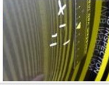
Wheel cover F R, Scratch(es), E - Replace 30,00