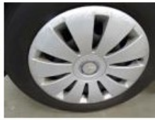
Wheel cover F L, Scratch(es), E - Replace 30,00