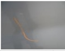
Bonnet, Bump(s) and scratch(es), LI - Repair and paint (complete) 217,56