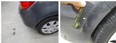
Wheel cover R R, Scratch(es), E - Replace 30,00