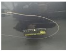
Door R L, Bump(s) and scratch(es), LI - Repair and paint (complete) 318,35