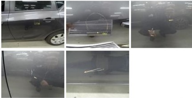
Wing R R, Scratch(es), LI - Repair and paint (complete) 308,20