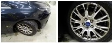
Door F L, Bump(s) and scratch(es), Le - Replace and paint 1082,52