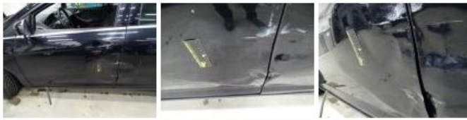
Door R L, Bump(s) and scratch(es), Le - Replace and paint 946,92