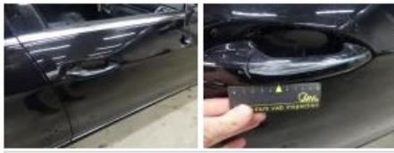
Bodywork, Scratch(es), 67 - Polish