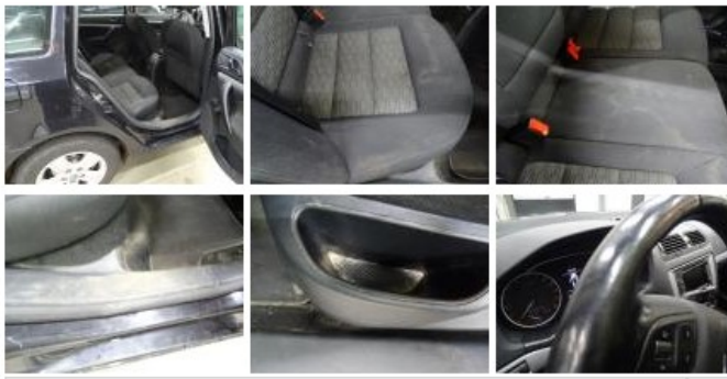
Door F R, Bump(s) and scratch(es), LI - Repair and paint (complete) 318,35