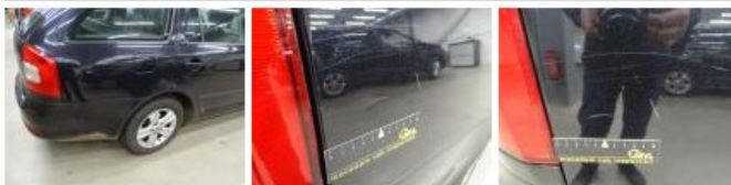
Wing F L, Scratch(es), LI - Repair and paint (complete) 220,18