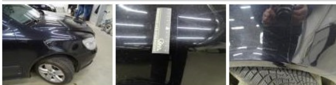
Door F L, Scratch(es), Acceptable 0,00