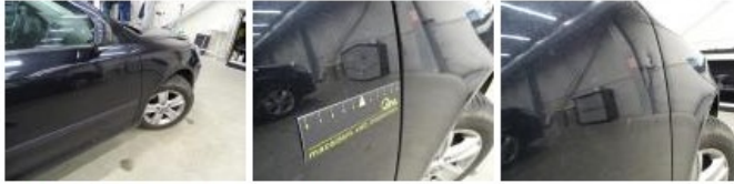
Alloy rim F L, Scratch(es), Acceptable 0,00