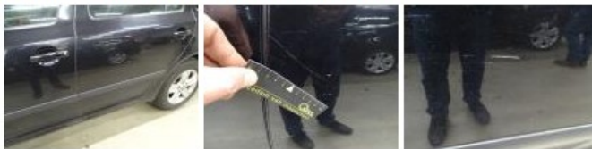
Wing R R, Scratch(es), LI - Repair and paint (complete) 308,20