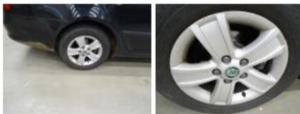
Alloy rim F R, Scratch(es), LI - Repair and paint (complete) 95,00