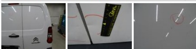
Trunk door R R, Missing, E - Replace 74,00