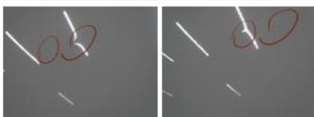
Trunk door R R, Bump(s) and scratch(es), It - Spot repair 115,56