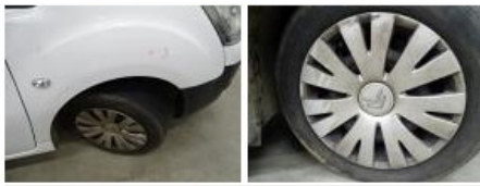
Bumper R, Bump(s) and scratch(es), Smart repair 110,64