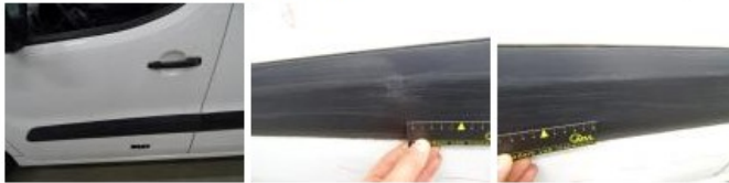
Wing R L, Scratch(es), LI - Repair and paint (complete) 231,15