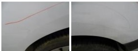
Wing F L, Bump(s) and scratch(es), LI - Repair and paint (complete) 165,13