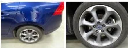
Alloy rim F R, Scratch(es), LI - Repair and paint (complete) 95,00