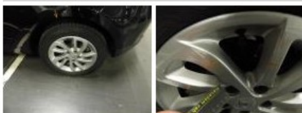
Wing R L, Scratch(es), LI - Repair and paint (complete)