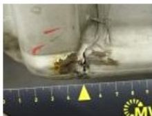
Wing F R, Bump(s) and scratch(es), LI - Repair and paint (complete)