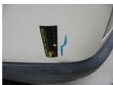
Door R R, Bump(s) and scratch(es), LI - Repair and paint (complete)