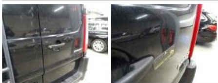
Bumper R, Bump(s), E - Replace 329,40