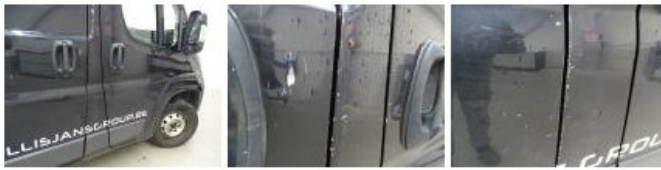
Wing R R, Bump(s), PDR - Knock out without painting 102,60