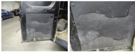
Sliding door R, Bump(s), LI - Repair and paint (complete) 382,02