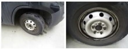
Wing R L, Bump(s) and scratch(es), LI - Repair and paint (complete) 231,15