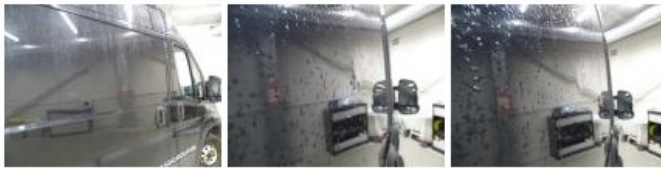
Bumper R, Scratch(es), Acceptable 0,00