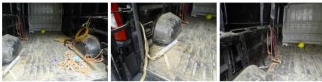
Rear bulkhead lining, Crack, E - Replace 39,00