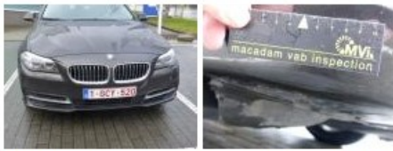
Door R L, Bump(s), PDR - Knock out without painting 63,00