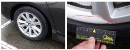
Front bumper, Scratch(es), It - Spot repair 115,56