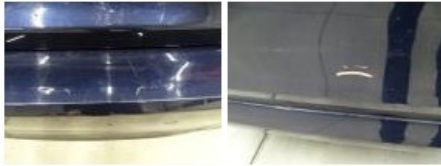
Door F L, Scratch(es), LI - Repair and paint (complete) 318,35