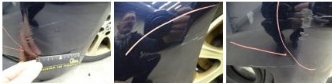
Alloy rim F R, Scratch(es), LI - Repair and paint (complete) 95,00