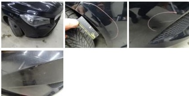
Wing F L, Scratch(es), LI - Repair and paint (complete) 220,18