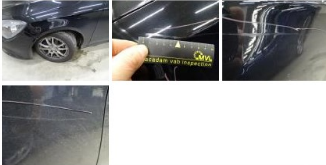
Alloy rim R R, Scratch(es), LI - Repair and paint (complete) 95,00