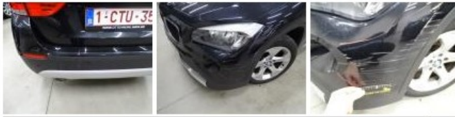
Front bumper, Bump(s), Smart repair 110,64