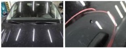
Front bumper, Scratch(es), LI - Repair and paint (complete) 211,80