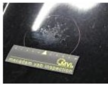
Wing R R, Bump(s) and scratch(es), LI - Repair and paint (complete) 308,20