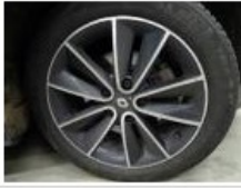
Alloy rim R R, Scratch(es), LI - Repair and paint (complete) 95,00