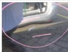
Internal Boot Lining R, Damaged, E - Replace 149,00