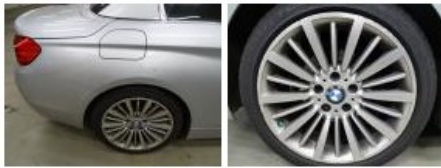
Alloy rim R L, Scratch(es), LI - Repair and paint (complete) 95,00