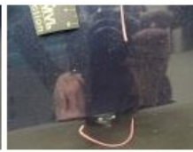
Bumper R, Scratch(es), LI - Repair and paint (complete) 0,00