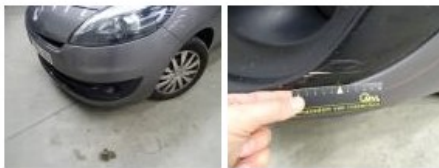
Bumper R, Bump(s) and scratch(es), LI - Repair and paint (complete) 211,80