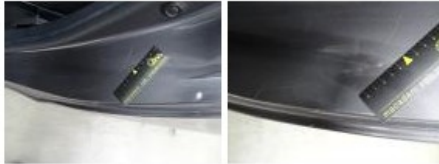
Front bumper, Scratch(es), Smart repair 110,64