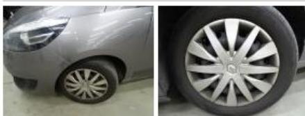
Wing R L, Bump(s) and scratch(es), LI - Repair and paint (complete) 308,20