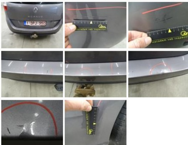
Wheel cover F L, Scratch(es), E - Replace 30,00