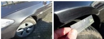
Door R L, Bump(s) and scratch(es), Acceptable 0,00