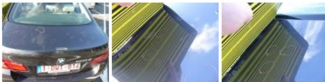
Bumper R, Scratch(es), Acceptable 0,00