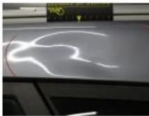
Wing R L, Bump(s), Acceptable