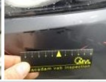
Headlight L, Damaged, E - Replace