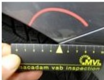
Tailgate, Scratch(es), Acceptable