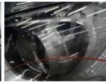
Wing F R, Scratch(es), LI - Repair and paint (complete)