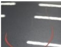
Wing R R, Scratch(es), Acceptable