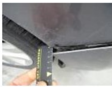
Front bumper, Scratch(es), LI - Repair and paint (complete)