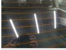
Bumper R, Bump(s) and scratch(es), LI - Repair and paint (complete) 326,16