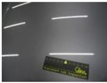
Bumper R, Scratch(es), LI - Repair and paint (complete) 169,44