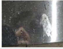
Alloy rim R R, Scratch(es), LI - Repair and paint (complete) 95,00