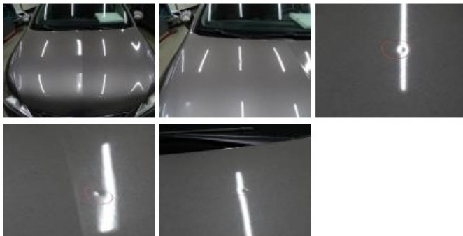
Wing F L, Bump(s), Acceptable 0,00