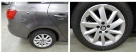
Door F L, Bump(s), LI - Repair and paint (complete) 318,35