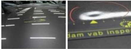
Bumper R, Scratch(es), LI - Repair and paint (complete) 211,80