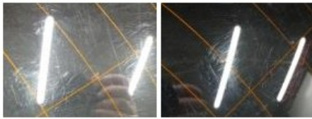
Wing R R, Scratch(es), LI - Repair and paint (complete) 308,20