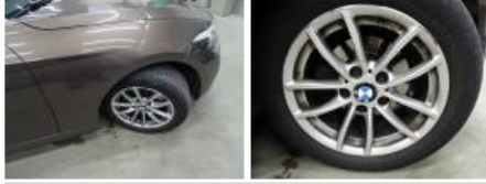
Alloy rim R R, Scratch(es), LI - Repair and paint (complete) 95,00