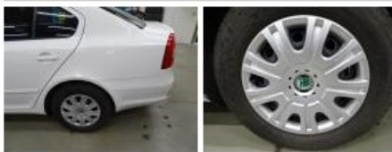
Wing R L, Bad repair, Acceptable 0,00