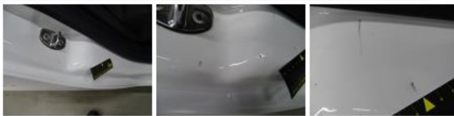
Tailgate, Bad repair, Acceptable 0,00