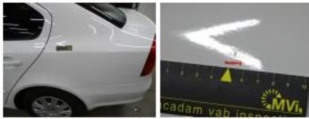
Wheel cover R R, Scratch(es), E - Replace 30,00