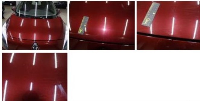
Roof, Chemical polution, LI - Repair and paint (complete) 481,50