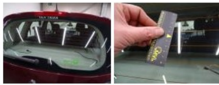
Wing R R, Scratch(es), LI - Repair and paint (complete) 308,20