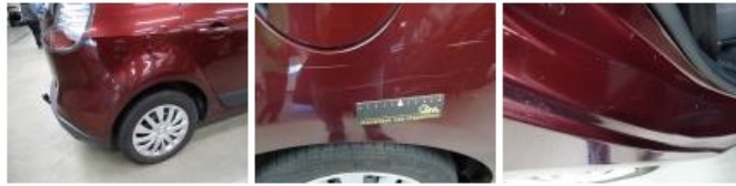
Door R R, Bump(s) and scratch(es), LI - Repair and paint (complete) 318,35