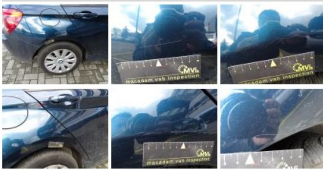
Wing F L, Bump(s), Acceptable 0,00