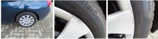
Wheel cover R R, Scratch(es), E - Replace 30,00