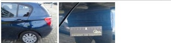
Wing R R, Scratch(es), LI - Repair and paint (complete) 308,20