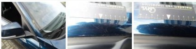
Wing R L, Scratch(es), LI - Repair and paint (complete) 308,20