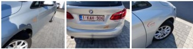
Alloy rim F L, Scratch(es), LI - Repair and paint (complete) 95,00