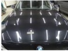
Bonnet, Bump(s) and scratch(es), LI - Repair and paint (complete) 348,09