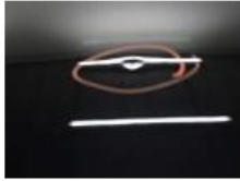
Windscreen, Repaired, Acceptable 0,00