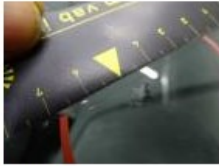
Bumper R, Scratch(es), Acceptable 0,00