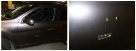
Bodywork, Damaged, Acceptable 0,00