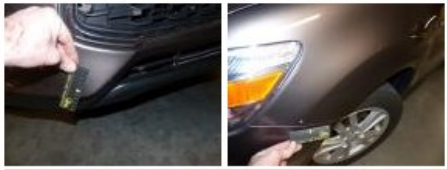
Wing R L, Bump(s), LI - Repair and paint (complete) 356,20