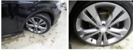
Alloy rim R L, Scratch(es), LI - Repair and paint (complete) 95,00