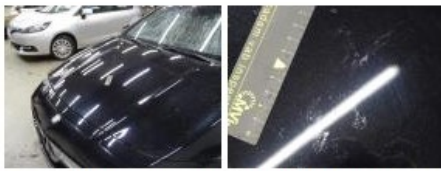
Bumper R, Bump(s) and scratch(es), LI - Repair and paint (complete) 259,80