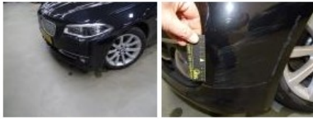
Bumper R, Bump(s) and scratch(es), LI - Repair and paint (complete) 350,16