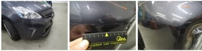
Door F L, Scratch(es), LI - Repair and paint (complete) 318,35