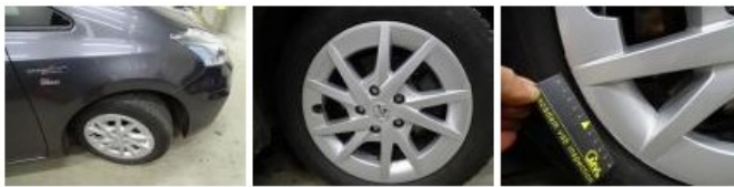
Wheel cover R R, Scratch(es), E - Replace 30,00