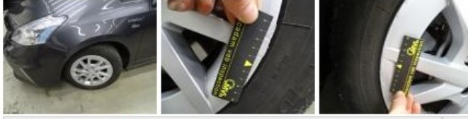
Wheel cover R L, Scratch(es), E - Replace 30,00