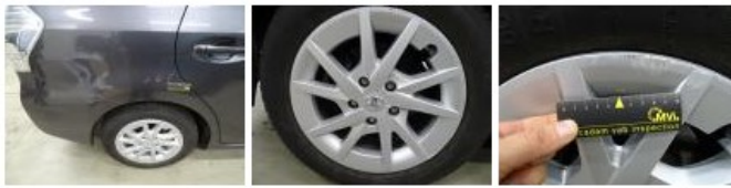
Front bumper, Scratch(es), LI - Repair and paint (complete) 211,80