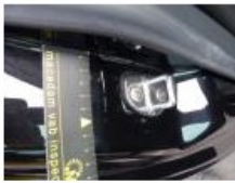
Door R R, Bump(s), PDR - Knock out without painting