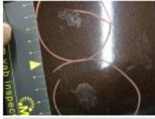
Bumper R, Bump(s) and scratch(es), LI - Repair and paint (complete) 211,80