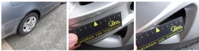
Wing R R, Scratch(es), LI - Repair and paint (complete) 308,20