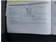
Roof, Hail damage, PDR - Hail 0,00