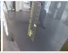
Tailgate, Scratch(es), LI - Repair and paint (complete) 301,68