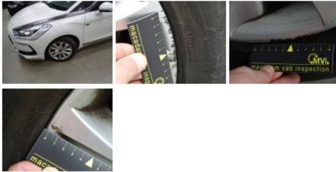
Alloy rim R R, Scratch(es), LI - Repair and paint (complete) 95,00