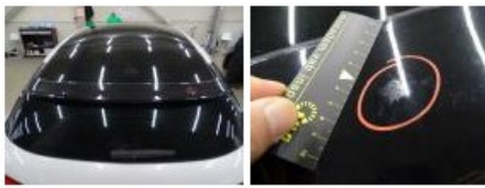
Rear window, Scratch(es), E - Replace 0,00