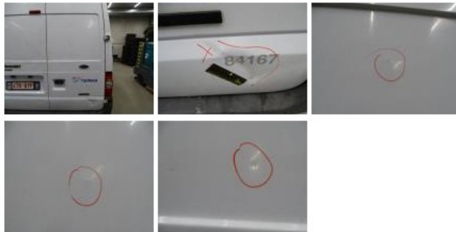
Wing R R, Rust, LI - Repair and paint (complete) 231,15