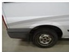
Wing R L, Bump(s) and scratch(es), LI - Repair and paint (complete) 231,15