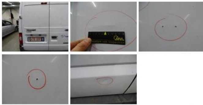
Trunk door R R, Bump(s) and scratch(es), It - Spot repair 115,56