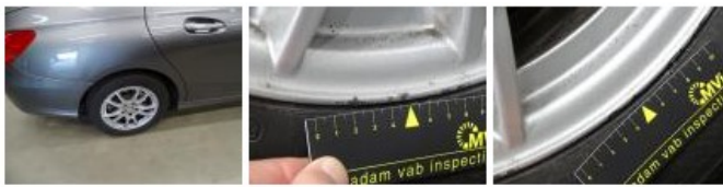
Front bumper, Bad repair, Paint 0,00