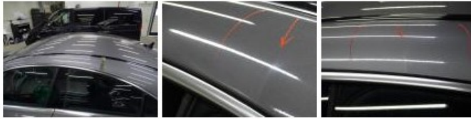
Bonnet, Hail damage, PDR - Hail 200,00