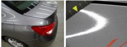
Wing R L, Bad repair, Paint 0,00