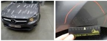
Roof pillar L, Bad repair, Paint 0,00