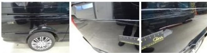
Alloy rim R L polished, Scratch(es), LI - Repair and paint (complete) 95,00