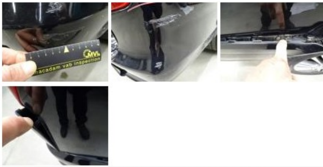
Alloy rim F L polished, Scratch(es), LI - Repair and paint (complete) 95,00