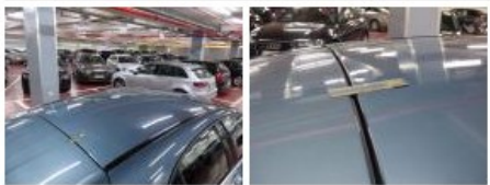
Roof, Bump(s), PDR - Knock out without painting 63,00