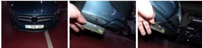
Bumper R, Scratch(es), LI - Repair and paint (complete) 259,80