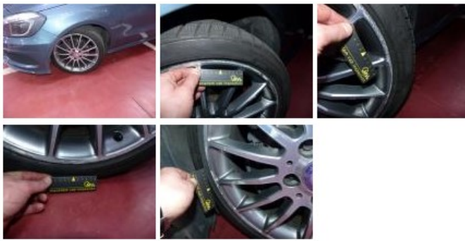
Alloy rim R R polished, Damaged, E - Replace 235,20