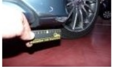
Alloy rim F R polished, Damaged, LI - Repair and paint (complete) 95,00