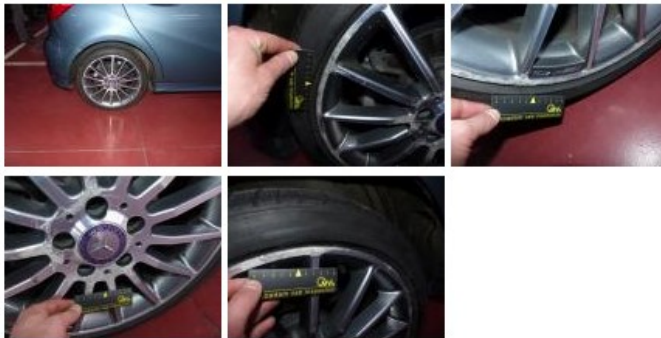
Alloy rim R L polished, Damaged, LI - Repair and paint (complete) 95,00