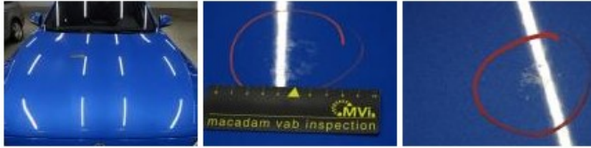
Wing R R, Scratch(es), LI - Repair and paint (complete) 308,20