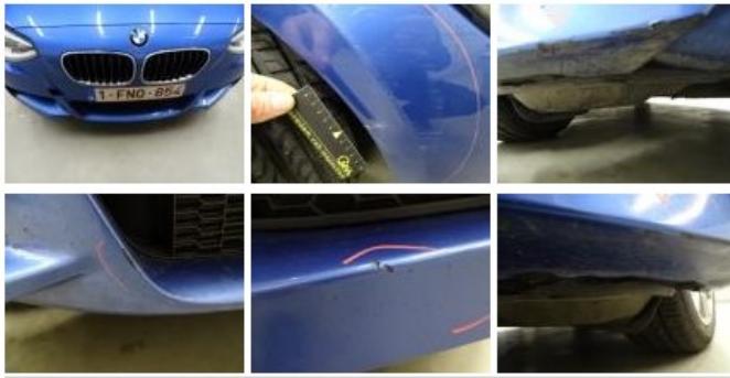
Bonnet, Chemical polution, LI - Repair and paint (complete) 290,08