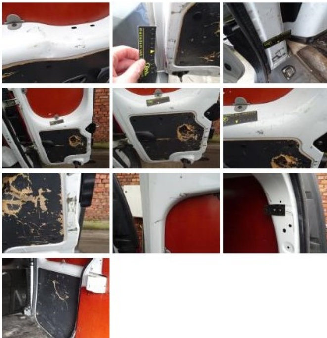
Bodywork, Glue residues, Acceptable 0,00